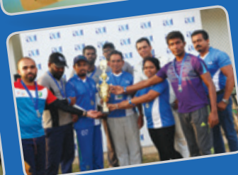
Members' Annual Cricket Tournament