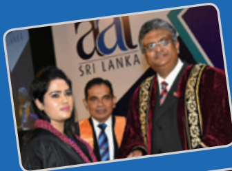
Receiving the distinguished membership at the Convocation