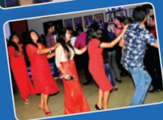
AAT Members' Night (Year end members' gathering)