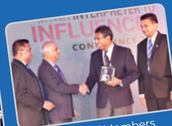
Inauguration of an Annual Conference of Members