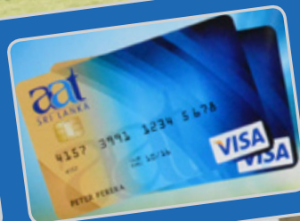
HNB affinity credit card for Members